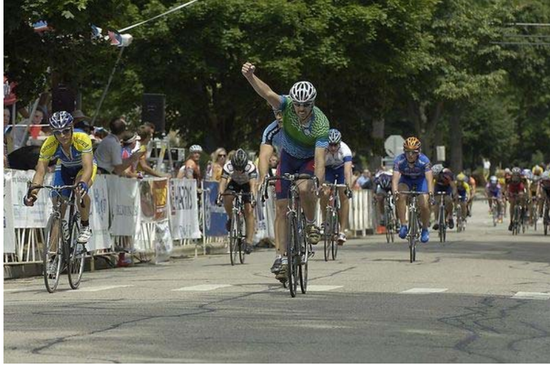
2005 Arlington Cycling Classic in Arlington, IL