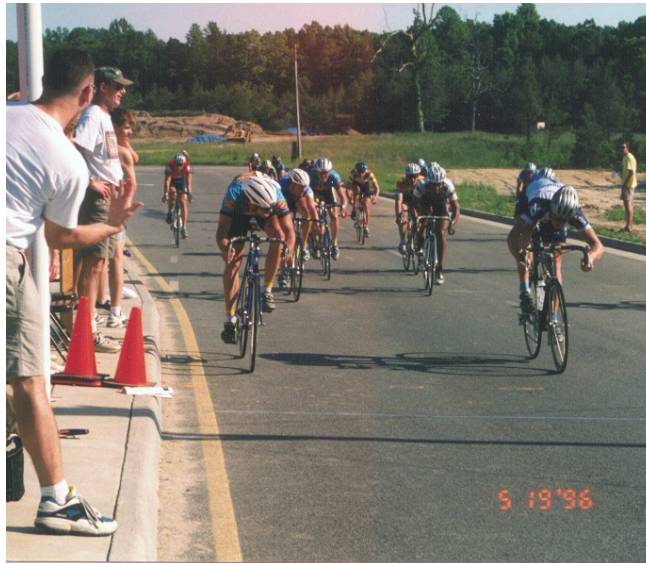
1996 Richbrau Professional Cycling Team-I won!