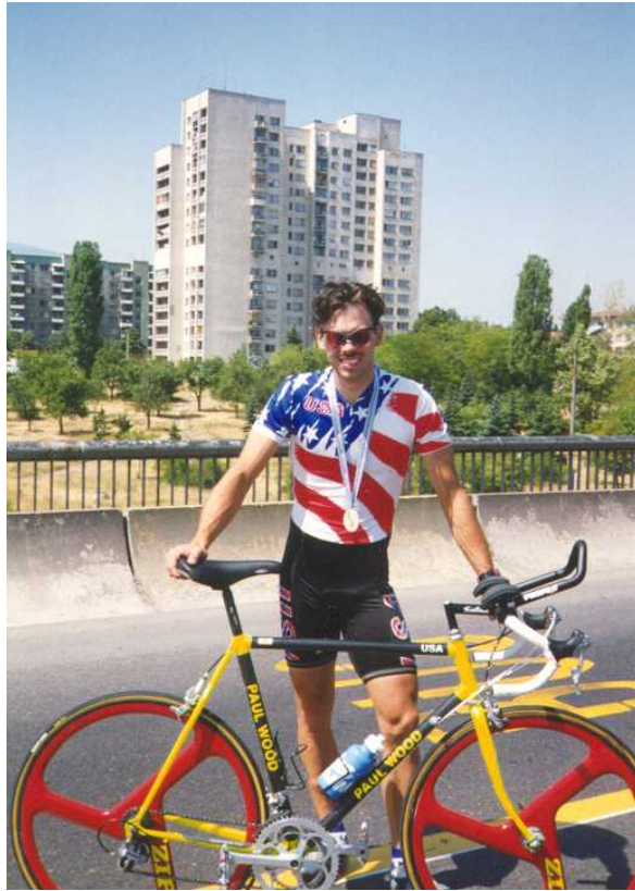
Silver Medalist-1993 Deaflympics Time Trail in Bulgaria