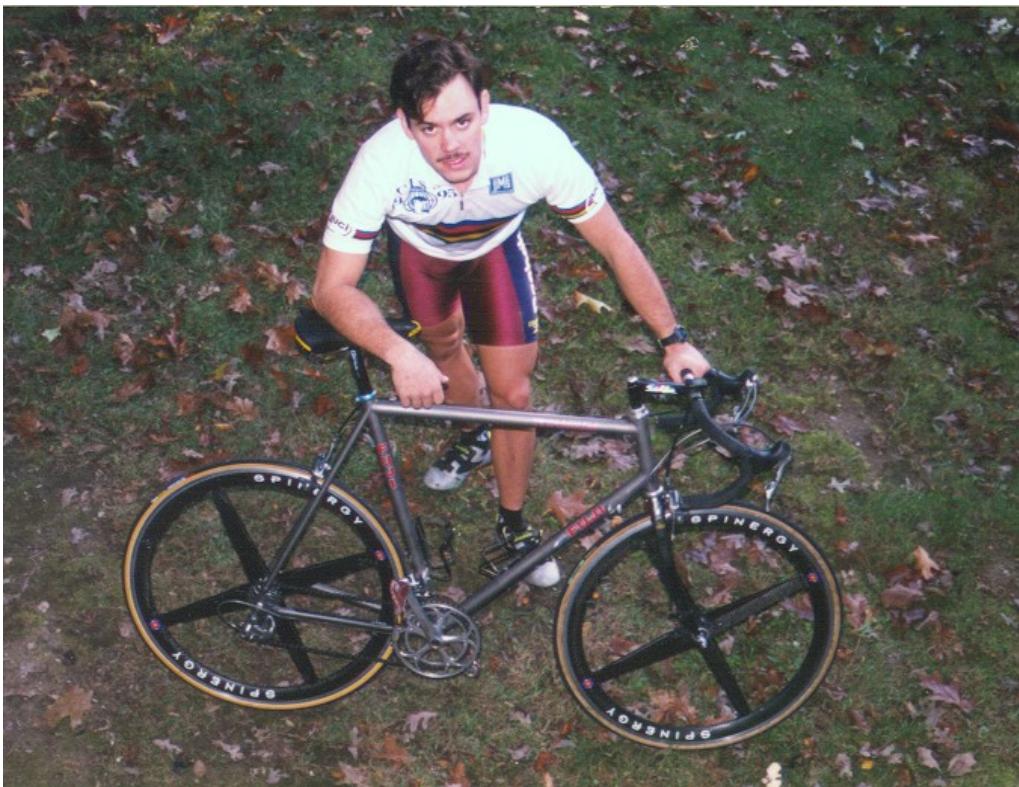
Gold Medalist-1995 World Deaf Cycling Championship in France