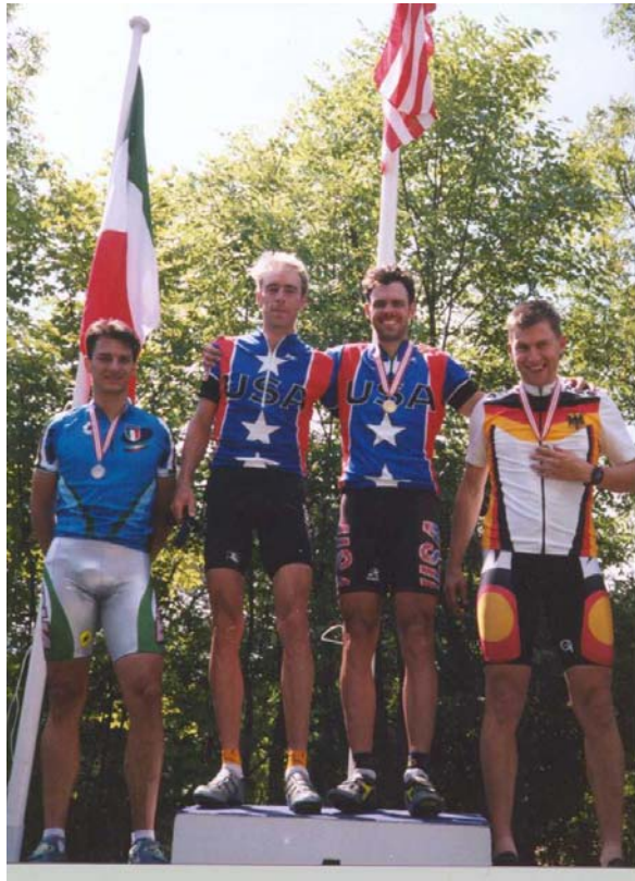
Gold Medalist-1997 Deaflympics Road Race in Rome, Italy