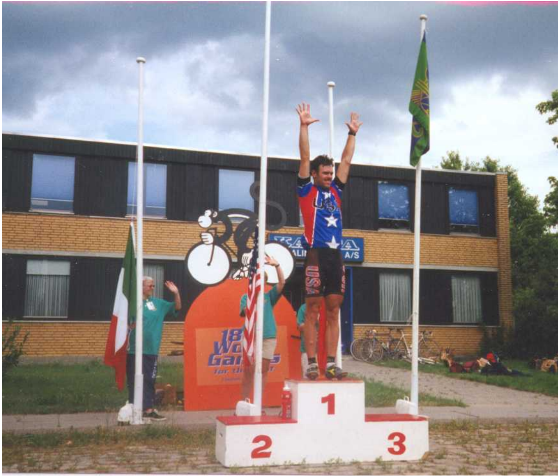
Gold Medalist-1997 Deaflympics Point Race in Denmark