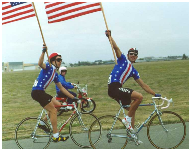
Silver Medalist-1989 Deaflympics Match Sprint in New Zealand