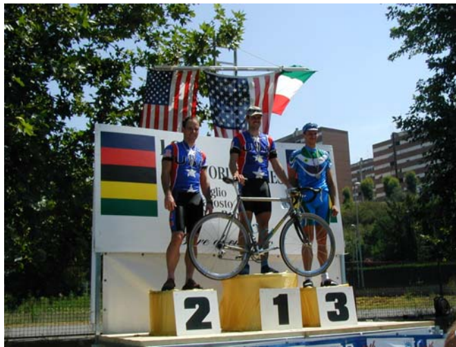
Gold Medalist-2001 Deaflympics Point Race in Rome, Italy