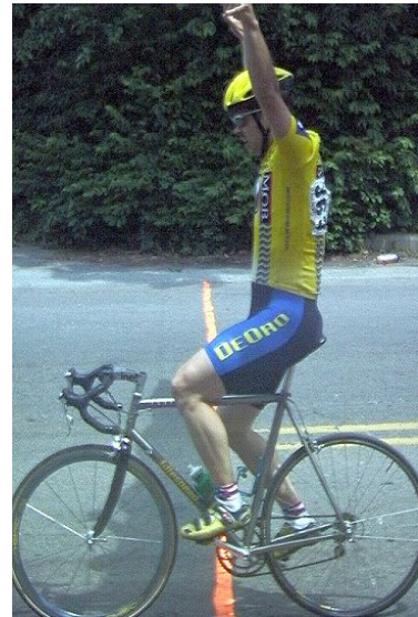
2001 Butler University Criterium in Indianapolis, IN