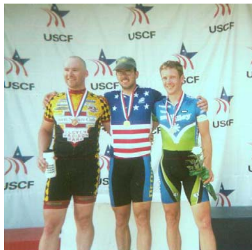
2000 Masters National Championship Criterium (30-34)