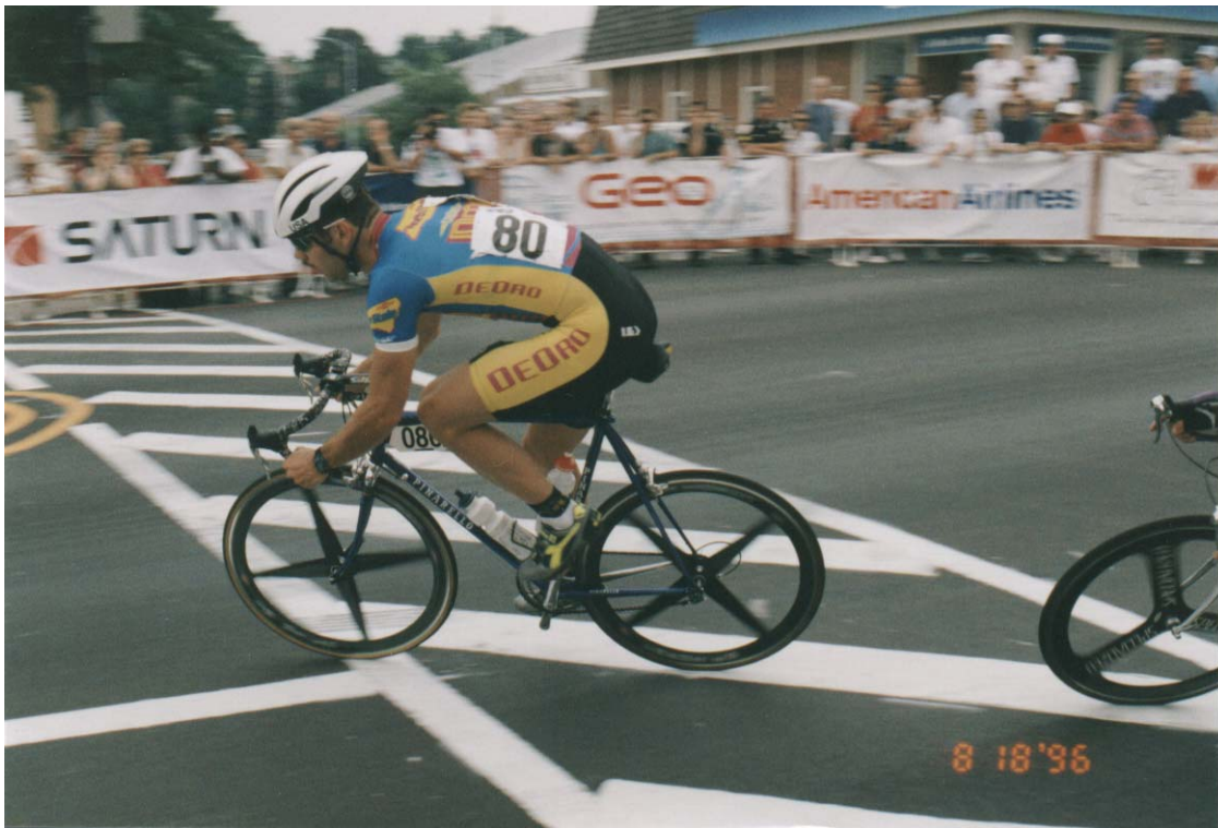
1996 US Professional Criterium Championship in Downers Grove, IL